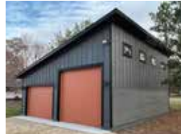
FULL GARAGE BUILD W/ MEP STACK