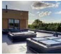
SPECIALTY ROOFING SYSTEMS