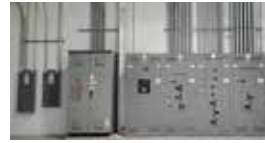
INDUSTRIAL MEP SYSTEMS