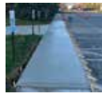
CONCRETE & MASONRY