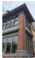
PAINTING & FINISHING